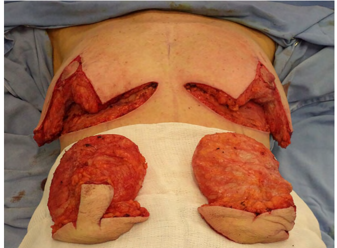
Figure 3. Bilateral resection.

The same procedure was performed on the contralateral breast, followed by bilateral total en bloc resection of the structures (Figure 3). The capsule was opened outside the surgical field for analysis of integrity, deformities, type, and size of the patient's implant (Figure 4). After delimitation and symmetrization of the detached areas in both breasts, bilateral retromuscular pockets were made starting with the incision of the pectoral muscle in the nearest portion of the mammary fold<sup>3,7</sup> (Figure 5).