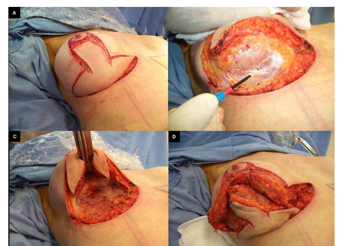
Figure 2. En bloc resection of the skin, breast tissue, fibrous capsule, and implant.

hemostasis and the perfect separation of the capsule and surrounding tissues.