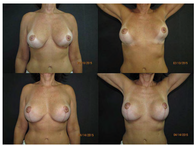
Figure 9. Results report.

Although implants are not completely covered by the pectoral muscle, covering the superomedial portion of the implant provides a natural result. In addition, a careful detachment of the lower part of the pectoral muscle and the maintenance of medial and lateral insertions allow implant accommodation, providing greater stability and reduced risks of postoperative displacement<sup>3,19,26</sup> (Figures 9A-9D).