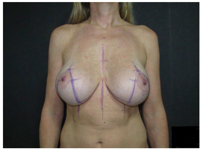
Figure 1. Preoperative marking.

Subsequently, all markings were photographed (Figure 1) and the positions of the future scars were shown to the patient.