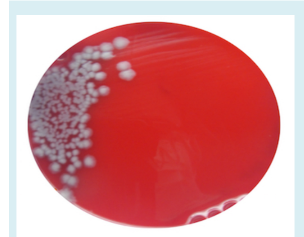
Figure 1. B. anthracis growth in blood agar (300 CFU).

agar cultures the results were obtained as direct CFU counts, and for BHI broth cultures using Geneaid Kit (Geneaid Biotech Ltd., New Taipei City, Taiwan) and visualizing the PCR product in UV illumination after electrophoresis. Figures 1 and 2 show examples of test results.