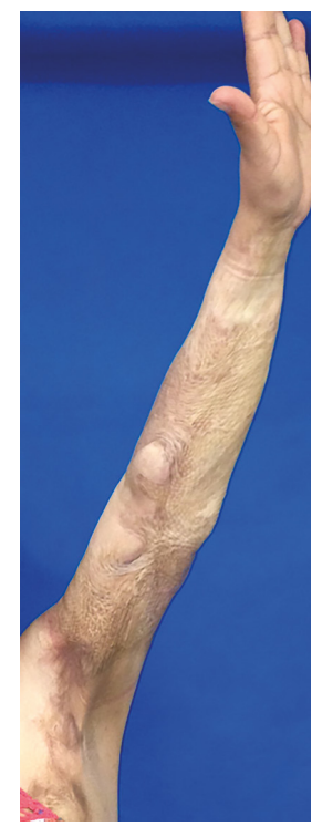
Figure 5. Clinical case 2. The patient showed a good functional recovery and full extension of the upper limb one year after surgery.

Several methods are available for the correction of scar retractions in the axilla. However, Z-plasty is notable for its simplicity and effectiveness. Z-plasty consists of the transposition of two or more triangular flaps to modify the axis of the final scar. Z-plasty flaps often have a 60° angle to one another, thereby resulting in an elongation of the scar by 75%.