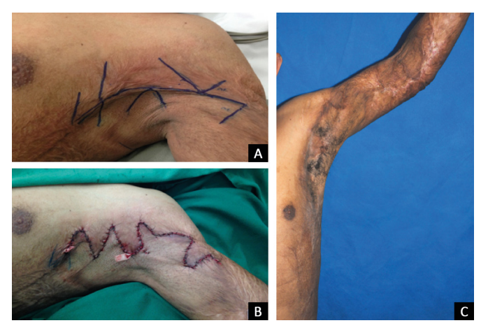
Figure 3. Before and after surgery. A: Marking before surgery; B: Immediately after surgery; C: One year after surgery. The release of the scars and a restoration of the range of motion are observed.

skin graft in the left antecubital fossa. The donor site of the graft was the left thigh. The occlusive dressing was performed using rayon, gauze, and bandage, and the left upper limb was immobilized with a plaster cast until the fifth day after surgery. The evolution of the case was satisfactory, with the release of scars and a restoration of the range of motion of the upper limb during the postoperative period (Figure 3).