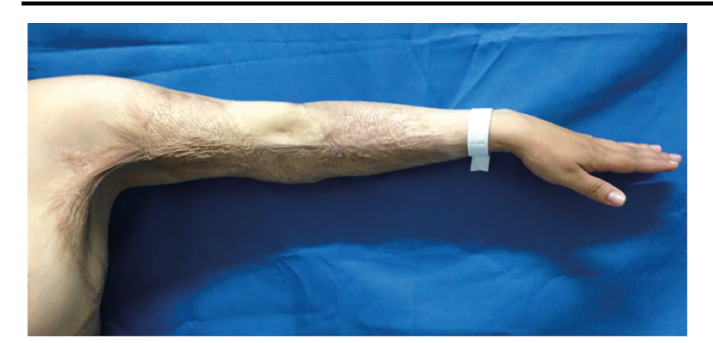
Figure 4. Clinical case 2. The patient was asked to abduct the left arm. We observed a limitation in the movement of the limb.