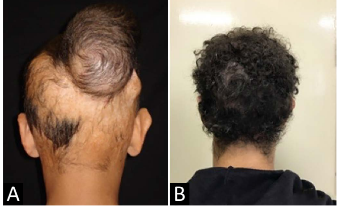
Figure 1. Patient with an area of alopecia on the scalp due to the burn submitted to treatment with tissue expander. A. Preoperative period; B. Final result after three-stage treatment with round type expanders.

Giant congenital nevus can be defined as an ectopic concentration of melanocytes of neuroectodermal origin with a diameter greater than 20 cm and affecting about 1 in every 20,000 live births<sup>4</sup>.