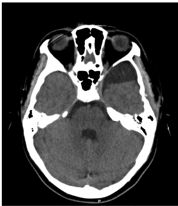
Fig. 4 Arachnoid cyst without bleeding. Exam date: August 6, 2014.

which still remains with its pathogenesis unknown. 1 This complication was visibly present in our patient.