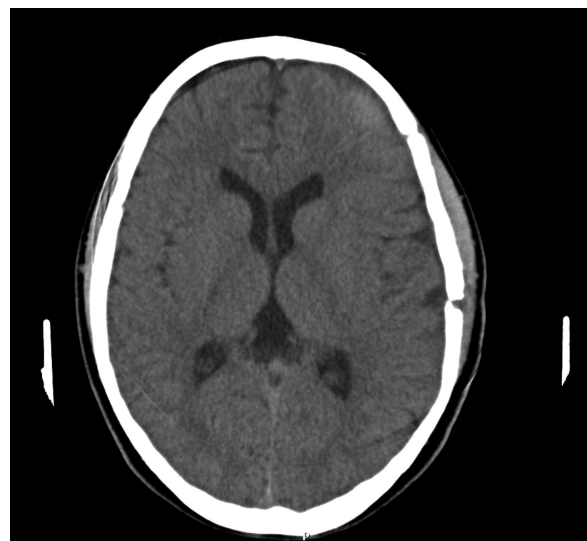
Fig. 3 The CT scan after a month of the craniotomy showing the resolution of the subdural hemorrhage. Exam date: August 6, 2014.