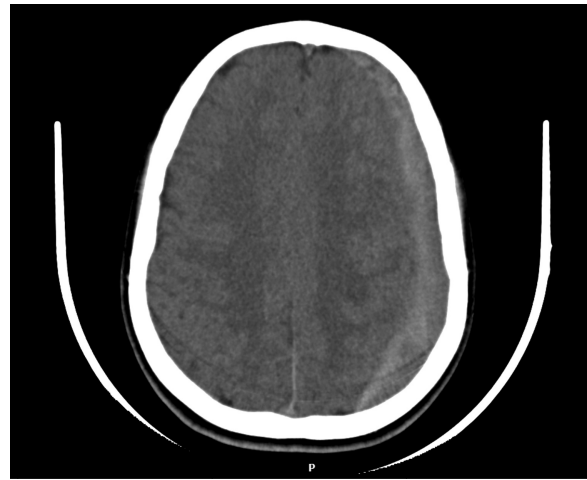
Fig. 2 Acute subdural hemorrhage. Exam date: July 4, 2014.

The arachnoid cyst corresponds to 1% of all non-traumatic intracranial lesions. The most common location is the middle cranial fossa. 4 It is presumably formed by a division of the arachnoid membrane caused by an increase in cerebrospinal fluid (CSF) pressure. 1 Other hypotheses are: 1-dysgenesis embryo in the formation of the arachnoid, secondary to a