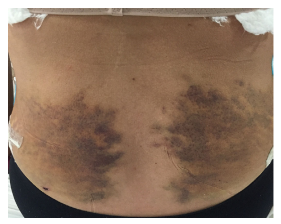
Figure 10. 4^{\rm th} postoperative day image of a patient in the control group.

that the preoperative period together with the use of the lymphatic taping and foam containment effectively reduced edema. There is no scientific evidence of this approach (pre-, trans-, and postoperative) in plastic surgery that would enable a comparison with our results.