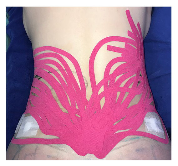
Figure 2. Fan taping on the flanks.

Fibrosis formation was evaluated during all care sessions through palpation, visual inspection, contact thermography analysis, and photodocumentation in both groups. Edema was analyzed based on perimetry and body weight in both groups, while ecchymosis was evaluated using photodocumentation in both groups.