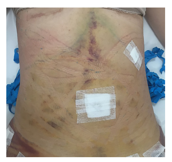
Figure 19. Visual analysis of ecchymosis formation on the abdomen.

There was a low occurrence of severe edema and ecchymoses in the EG. The use of a compression plaque for the operated region, involving the entire abdominal circumference of the patients, was associated to the application of the lymphatic taping technique to assist in the absorption of edema with the patient still in the surgical (transoperative) block and responsible for this low rate of edema and ecchymoses.