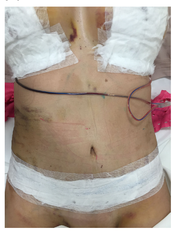
Figure 7. 4^{\rm th} postoperative day image of a patient in the experimental group.

Vecchio<sup>11</sup>, who found absorption of ecchymosis with application of taping.