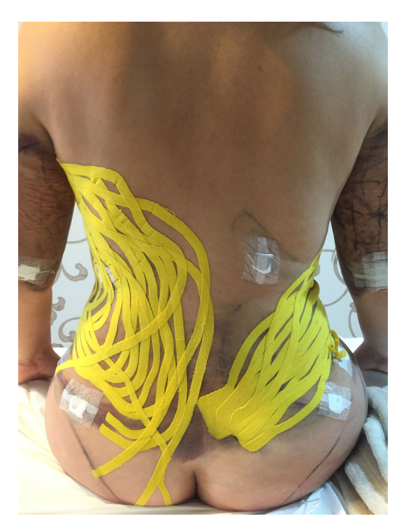
Figure 14. Taping in the left axillary base and right coccygeal base.