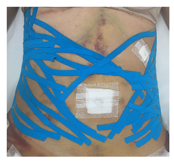
Figure 18. Placing of taping on the abdomen.