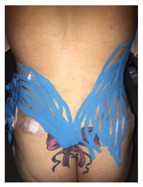
Figure 16. Taping in the right axillary base and left coccygeal base.

The application of taping in its various forms aims to promote redirection of the lymphatic circulation, reducing edema in places where it is installed<sup>16</sup>. This