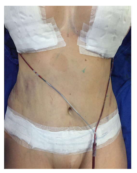
Figure 6. Transoperative aspect of a patient in the experimental group.

The EG obtained significant results (p = 0.0002) in the resolution of ecchymosis compared to the CG. This finding corroborates with those of Zanchet & Del