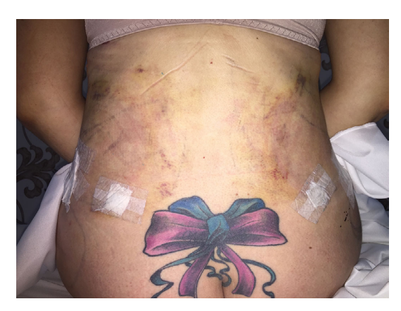
Figure 17. Result of taping application.

finding corroborates the indications of Kase et al.<sup>17</sup>, who reported removal of edema from the directioning of exudates toward the lymphatic ducts and increasing the local circulation.