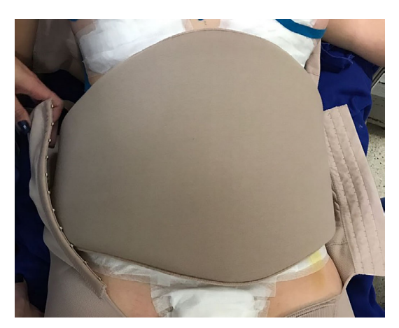
Figure 3. Containment foam under the surgical mesh.

The following data were statistically analyzed in both groups: number of sessions; start of fibrosis; resolution of fibrosis; resolution of ecchymosis; perimetry of the iliac crest, inframammary groove, and navel; initial thermography; degree of fibrosis; ecchymosis type; and pain.