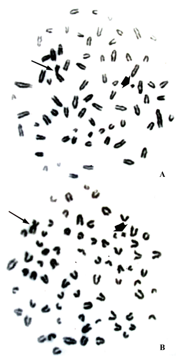
Figure 1. Mitotic metaphase chromosomes of males bush dog ( Speothos venaticus ) visualized by standard Giemsa staining. The Y chromosome is acrocenric and the smallest of the complement (A). The Y chromosome is metacentric at specimens kept in captivity, although these animals correspond to an offspring of a wildlife female (B). The bold arrows indicate the Y chromosomes and the thin arrow indicate the X chromosomes.

South American canids present as karyotypic pattern, many and small acrocentric chromosomes, whose numbering is difficult, as well the identification of homologous pairs. Their karyotype is very similar to that of the grey wolf ( Canis lupus ), and the latter is regarded as the oldest species, ancestor of the remaining ones. If we consider the Canis lupus a karyotype basal for the family, the chromosomal rearrangements that occurred over the group evolution can be suggested. According to Wayne et al. (1987a and b), Chrysocyon brachyurus (2n = 76), that is considered the oldest South