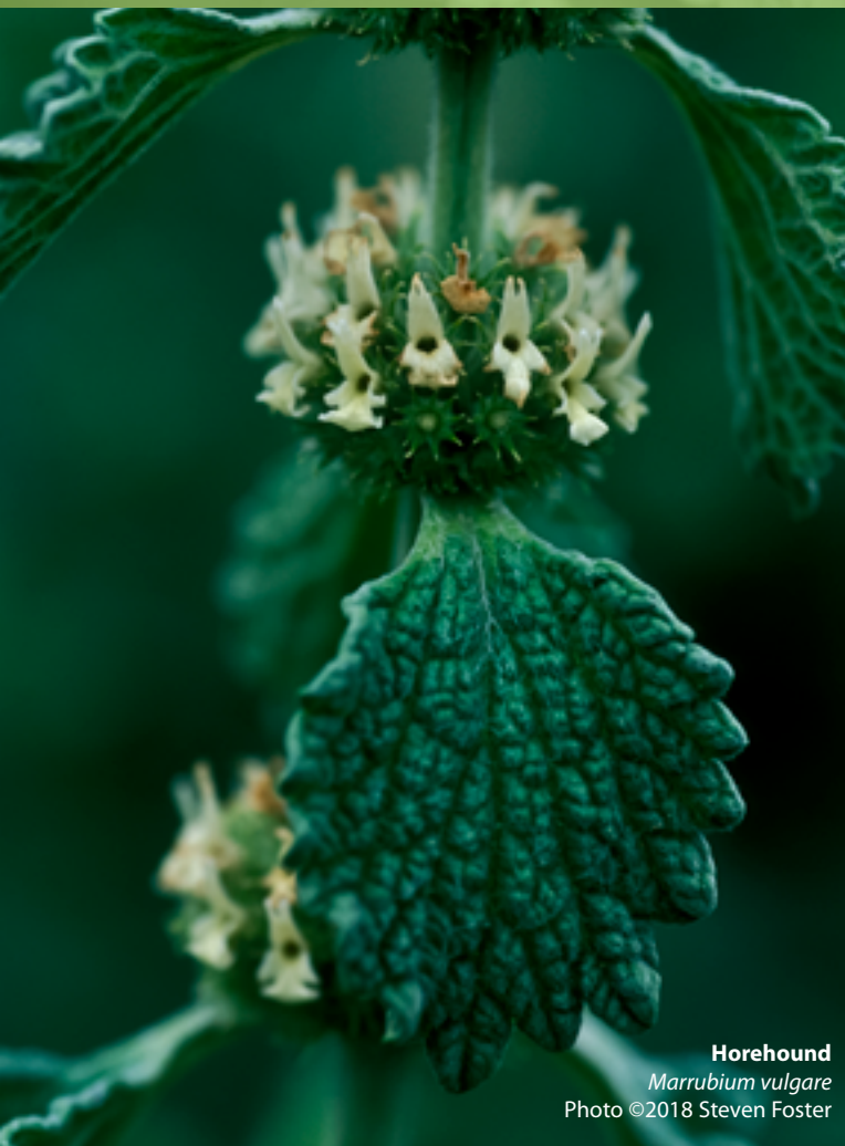
Horehound Marrubium vulgare