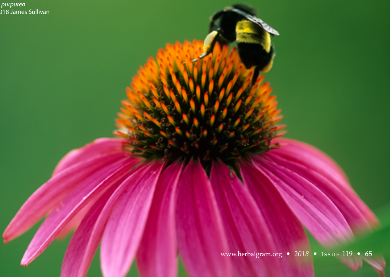
Echinacea Echinacea purpurea