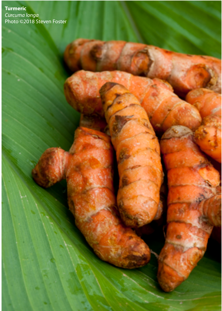
Turmeric Curcuma longa

Moringa ( Moringa oleifera , Moringaceae), which also made its debut among the 40 top-selling herbs in the natural channel in 2017, was the only other ingredient with an increase in sales of more than 30% from 2016. Moringa, like nigella, is a botanical commonly used in Ayurvedic medicine that has general health and nutrition benefits.