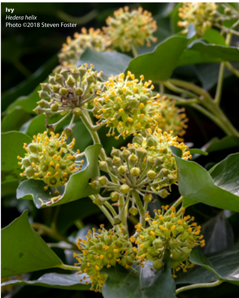
Ivy Hedera helix

For the first time, cannabidiol (CBD), a naturally occurring, non-intoxicating compound in Cannabis species (Cannabaceae), ranked among the 40 top-selling herbal supplement ingredients in the US natural channel. CBD