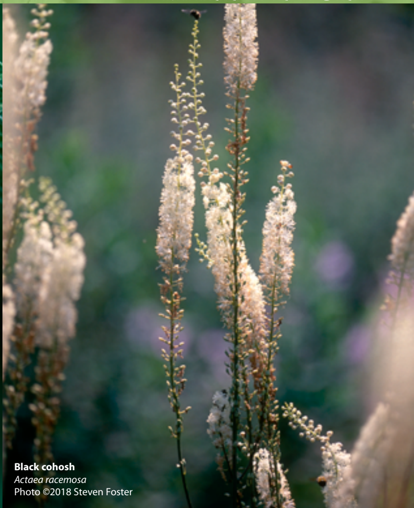
Black cohosh Actaea racemosa