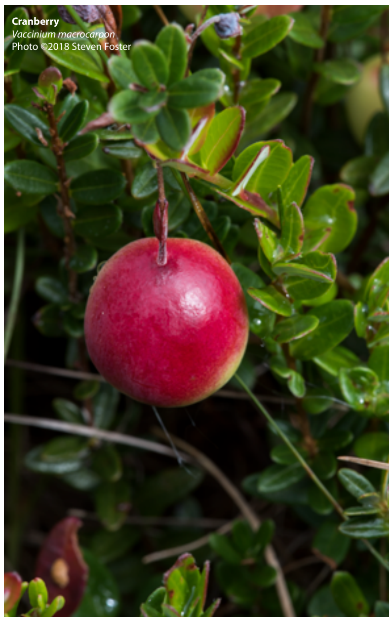
Cranberry Vaccinium macrocarpon