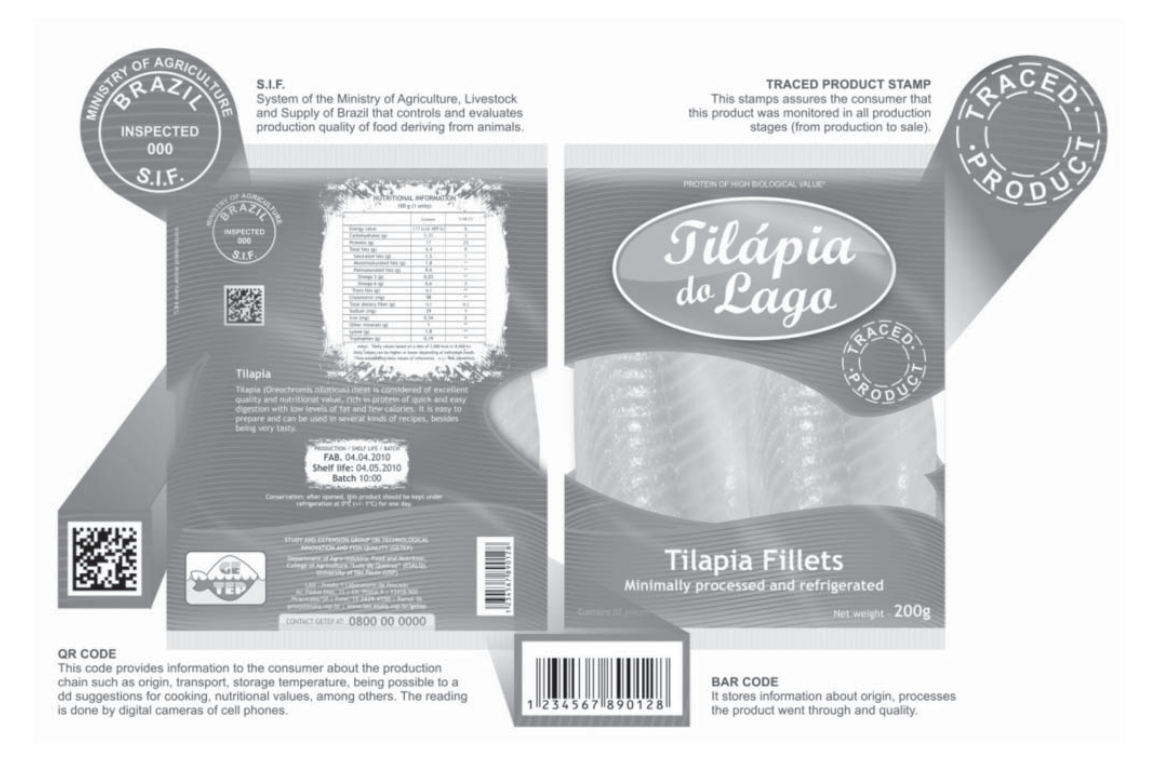
FIGURE 1 - PACKAGE WITH HIGHLIGHTS CONTAINING THE FILLET OF TILAPIA MINIMALLY PROCESSED AND REFRIGERATED

Once the acceptance of the product was positive, the final design of the label was performed including the results of the fillet analyses and electronic coding, following the labeling standards and standardization proposed by ANVISA (BRASIL, 2005). The Figure 1 shows the final labeling with the highlighted codes.