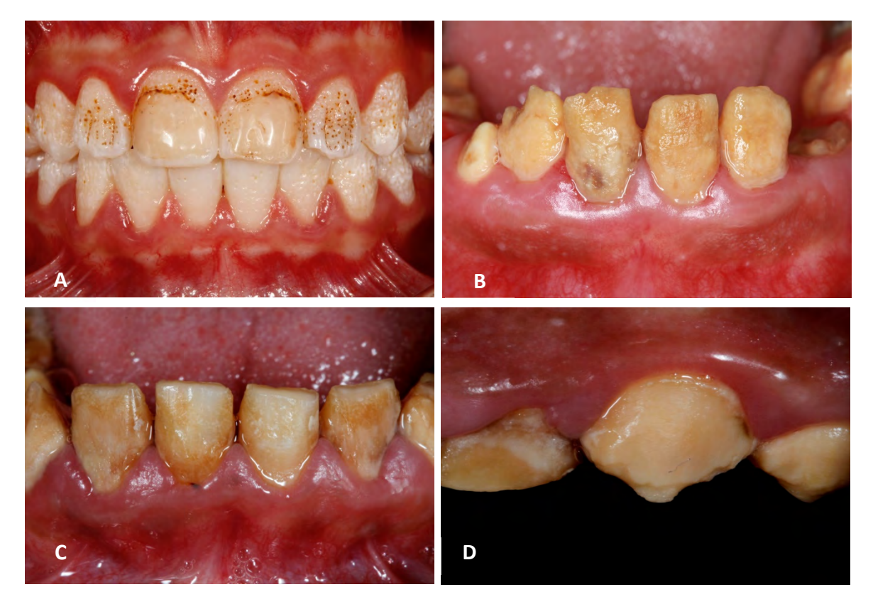
Figure 2. Variation of dental phenotype in amelogenesis imperfecta

(A) Hypoplastic AI: dental enamel with thin, yellow-brown ditches or depressions (B) Hypomaturation AI: dentine is soft and rough. It shows a mottling with snowflakes appearance. (C, D) hypocalcified AI: yellow-brown soft, friable dental enamel. Note the early enamel loss.