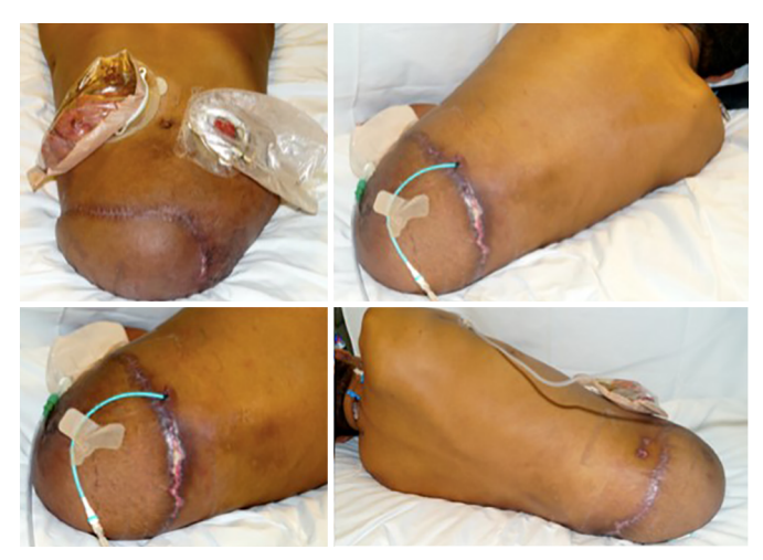
Figure 5. Postoperative.

results. One complication was a collection of 80 mL of fluid under the surgical flap, which was drained by computed tomography-guided needle aspiration, and the remaining drains were removed. There was partial loss of continuity between the epidermis and dermis along a 6-cm suture line, but surgical intervention was not required (Figure 5).