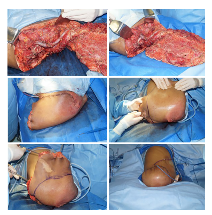
Figure 4. Closure.

results. One complication was a collection of 80 mL of fluid under the surgical flap, which was drained by computed tomography-guided needle aspiration, and the remaining drains were removed. There was partial loss of continuity between the epidermis and dermis along a 6-cm suture line, but surgical intervention was not required (Figure 5).