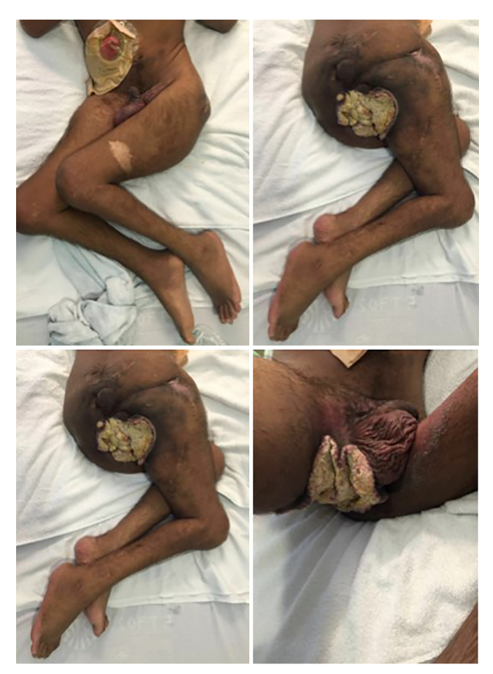
Figure 1. Preoperative.

The patient was moved to the left decubitus position and the spine surgeons sectioned the spine at L4/L5 and sutured the dural sac. The position was again changed to HDD, followed by ligation of the right and left internal common iliac veins, sectioning of the remaining paravertebral muscles, and disarticulation (Figure 3). A new distal colostomy was performed for reimplantation of the ureters and closure of the peritoneum. The flap was positioned for tissue closure, excess flap tissue was discarded, closure was performed with two Blake drains, and the incisions were sutured in planes (Figure 4).