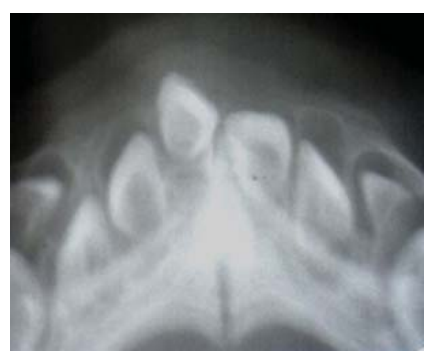
FIGURE 2 - Modified occlusal radiograph of the anterior region of the mandible.

The treatment plan involved local surgical intervention and monitoring of the eruptive process. The intervention consisted of topical anesthesia (xylocaine 5%) and infiltration anesthesia (lidocaine 2% with vasoconstrictor). Following anesthesia, an incision was made using a scalpel blade number 15 in order to expose the crown of the affected tooth and drain the fluid from inside the cyst (Figure 3).