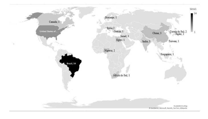
Figure 2. Countries in which the studies were conducted, in absolute numbers.

Regarding the theme mentioned by the authors of the selected studies, 43 (68.3%) mentioned researching strategies to cope with stress, while the others (20; 31.7%) used the classification "coping strategies" . Regarding the latter, it is emphasized that 18 (28.6%) studies came from Brazil, which may show a preference for the use of the term "coping strategies" in other countries.