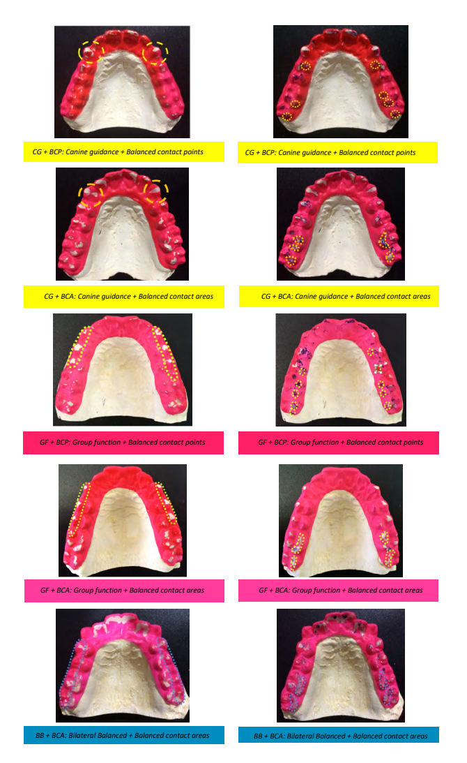
Figure 1. Classification of occlusal patterns found in the study population using a Bruxchecker<sup>®</sup>

areas) of the markings observed on both the working side (laterotrusion) and balancing side (mediotrusion) (Figure 1).