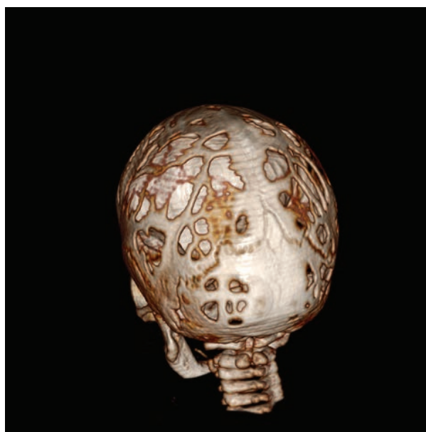
Fig. 1 3-D reconstruction CT scan depicts the sagittal craniosynostosis and the multiple bone defects of Lückenschädel.

The complex of Chiari malformations was first described in 1883 by Cleland, and graded in 1891 by the Austrian pathologist Hans Chiari. It denotes a heterogeneous group of anatomical anomalies involving the posterior cranial fossa,