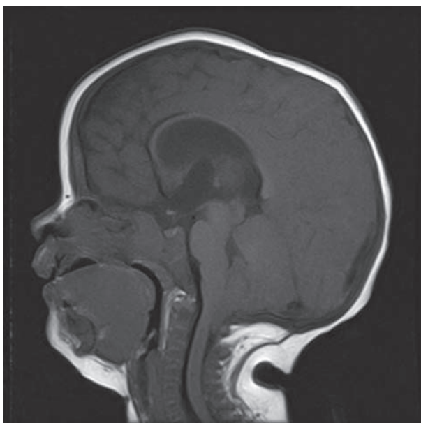
Fig. 3 Sagittal T1W MRI depicts the reduced size of the posterior fossa, low-setting torcular herophili, and herniation of the cerebellar tonsils through the foramen magnum.

The Lückenschädel and craniosynostosis diagnoses are done through imaging studies, both X-ray and computed tomography, in which is possible to see the bone defects and fusion of the cranial sutures. When examining X-rays or CT with 3D