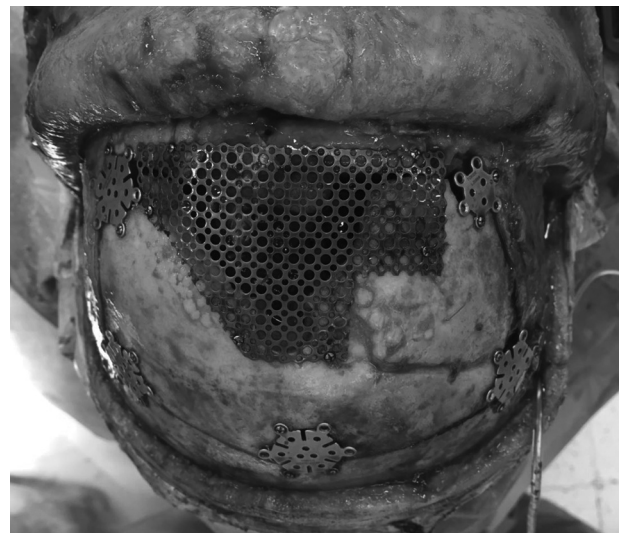
Fig. 1 Intraoperative aspect of cranioplasty with a titanium mesh to cover a frontal defect.

Acrylic resins gained surgical interest due to their successful application to the modeling of dental prostheses. Polymethylmethacrylate (PMMA) is a polymerized ester of acrylic acid discovered in the 20th century, and it was used for the first time in surgical practice by Zander in 1940. 10 This material has strength and biocompatibility comparable to those of the bone, and adheres to the dura mater without reacting with soft tissues. Its advantages over metals include greater flexibility, lower heat conductivity, decreased