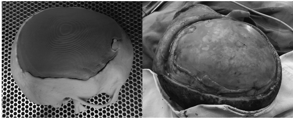
Fig. 2 Cranioplasty with a custom-made PMMA prostheses based on tomographic 3D images. Cranial model and the prosthesis before sterilization process (left); Intraoperative aspect after fixation to the skull (right).

density and lower cost, as well as its radiolucent property, allowing the visualization of underlying tissues at imaging. Moreover, recent technological advances led to the development of custom-made prostheses based on 3D computed tomographic images, with excellent esthetic results 15 (→ Fig. 2 ). Polymethylmethacrylate is one of the most used materials for reconstruction of cranial defects, but its main disadvantages are the risk of decomposition, infections and rupture of the material. For this reason, in neurosurgical practice, titanium plates are used in combination to provide support for the acrylic, increasing its mechanical strength and allowing better modeling of the prosthesis 3,4,10 (→ Fig. 3 ).