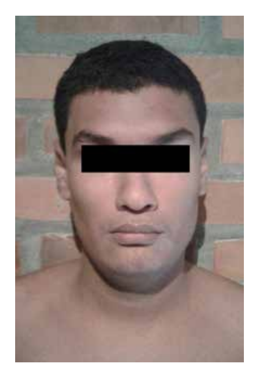
Figure 1. Proband, III-4. A 19-years-old male with full mutation. Facial features include long face, prognathism and large ears

On physical examination height 179 cm, weight 89 kg, BMI 27.8 kg /m2. As particular features he has a long face, large ears and prognathism. Normal hearing screening. He remains attentive and collaborates during the evaluation and shows no aggressiveness. He uses a language with few words, non-repetitive (Figure 1).