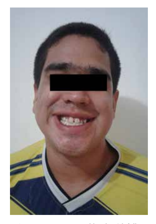
Figure 2. Case 2, III-1. A 19-years-old male with full mutation. Special findings include long face, broad forehead, synophrys, and prognathism

On physical examination height 179 cm, weight 113 kg, BMI 35.29 kg/m2, cephalic perimeter: 60 cm, long face, broad forehead, synophrys, high palate, prognathism, large ears (7.5 cm x 4,5 cm), joint hypermobility (Beighton 5/9), thoracolumbar scoliosis and abdominal striae (Figure 2).