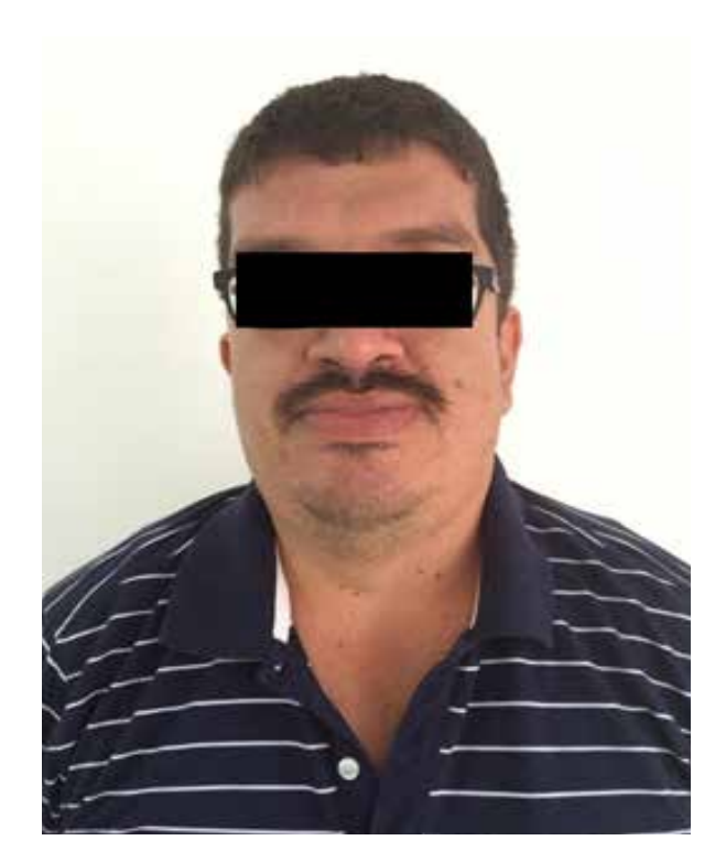
Figure 3. Case 3, II-1. A 37-years-old male with full mutation. Physical features include long face, large ears and prognathism

Molecular testing for FXS using blood spot cards showed the presence of a full mutation with an expanded allele of > 200 CGG repeats in two of the cases described above (II-1 and III-1 see Figure 4a and b). The proband was previously tested in Cali, Colombia.