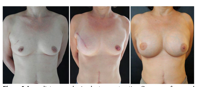
Figure 5. Immediate expander-implant reconstruction. Sequence of pre- and postoperative photos after expander placement and finally after the third surgery with expander replacement, nipple–areola complex reconstruction, and symmetrization.