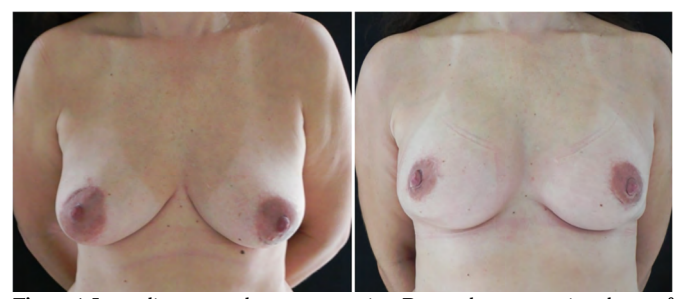
Figure 1. Immediate expander reconstruction. Pre- and postoperative photos of a patient undergoing mastectomy with expander reconstruction subsequently replaced with an implant.