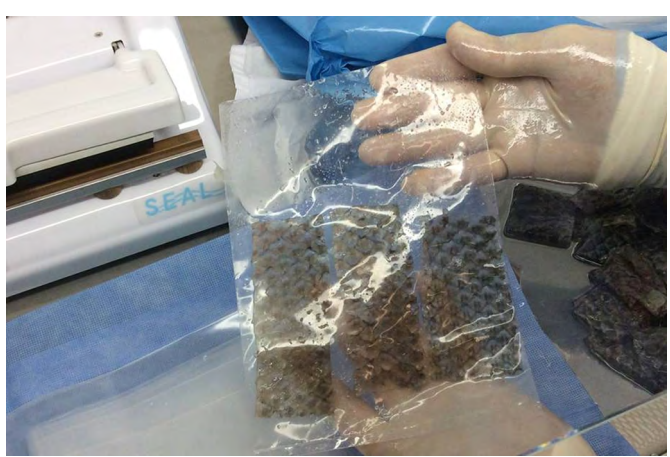
Figure 2B. Tilapia skin prepared and packed by the team.

After obtaining the tilapia skin with double wrapping, the researchers were not satisfied; to facilitate transportation to other states and countries, besides decreasing the cost since it is meant to be a product that can be on the shelf, they developed lyophilized tilapia skin.