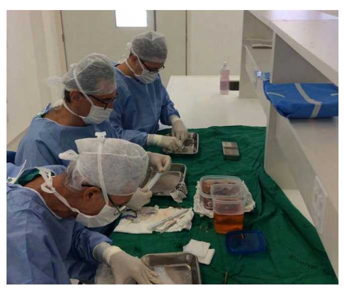
Figure 2A. Cleaning and preparation of the tilapia skin by the responsible team.

Some of the processing stages are shown in Figures 2a and 2b.