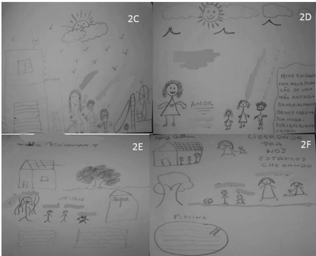
FIGURE 2: Representation of the external environments of family life before detention. Aquiraz, CE, Brazil, 2019

The drawings demonstrate a positive perspective regarding the future outside prison walls and close to their children, a feeling that was mentioned by mothers in their explanations of the drawings and observed in all subsequent contacts with inmates. This perception corroborates the results of another study that found that the main motivation for women to get out of prison was the reestablishment of emotional bonds with their children 10 . This desire motivates work and good behavior in prison and makes them capable of facing the adversities experienced in prison 11 .