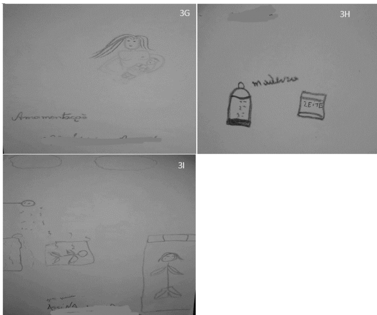
FIGURE 3: Representation of the child's feeding and bathing care. Aquiraz, CE, Brazil, 2019

Breastfeeding was represented only once, but all the inmates were seen breastfeeding. Even cross-breastfeeding was observed on the first day of the visit to the facility.