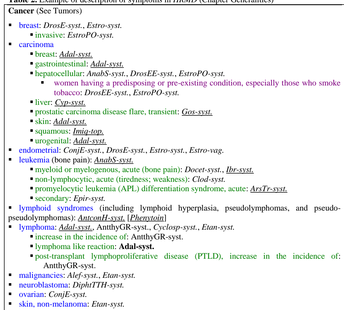
Table 2. Example of description of symptoms in HRMD (Chapter Generalities)

Pathogenetic symptoms listed in HMMMD were distributed following the traditional model of homeopathic repertories. Consequently it was adopted the same arrangement of chapters and all drugs which awakened a same symptom are grouped together under rubrics and subrubrics . Drugs are mentioned by abbreviations of their names and different fonts indicate the score of the relative " frequency of incidence " of each one. To facilitate the search of the most accurate rubric in all chapters, "crossed references" point to similar pathogenetic manifestations. The overall structure is illustrated with the example of rubric "Cancer", included in chapter "Generalities" of HRMD (Table 2).