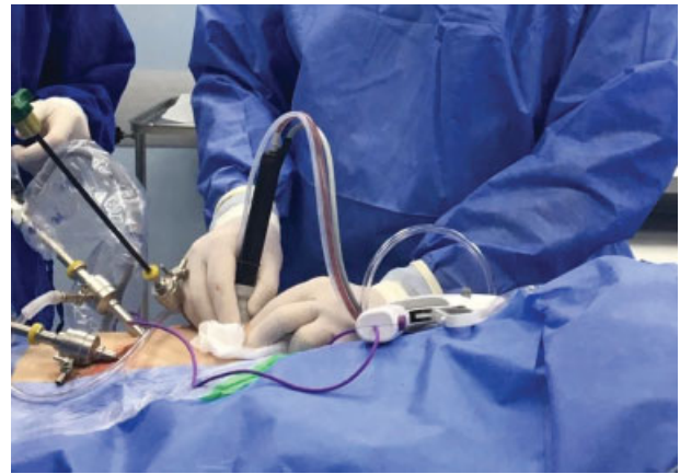
Fig. 2 Laparoscopic surgical route showing the distribution of the trocars, as well as the ultrasonic aspirator during the infraumbilical paraincision.

with mean arterial pressure (MAP) and bispectral index (BIS) monitoring. A 1-cm infraumbilical incision was made to introduce the first trocar (10 mm). The second trocar (5 mm) was inserted into the left iliac fossa, and the third (10 mm) into the right flank (► Fig. 2). An initial inspection of the region showed a bulge in the right iliac region displacing the rectum to the left, posterior to the uterus.