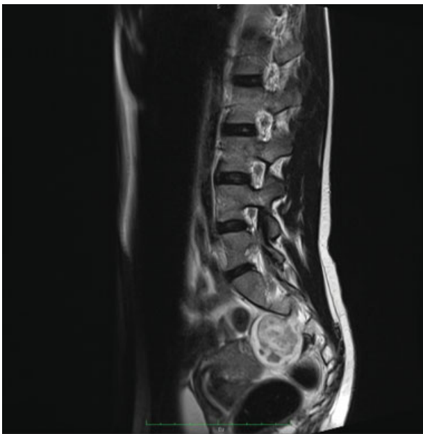
Fig. 1 Lumbosacral spine contrast-enhanced magnetic resonance imaging. (A) Sagittal T2-weighted image showing tumor location in the presacral region.

We chose to perform laparoscopic surgery with the aid of the ultrasonic aspirator. The patient was submitted to pure intravenous general anesthesia and orotracheal intubation,