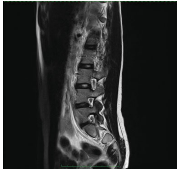
Fig. 4 Lumbosacral spine contrast-enhanced T2-weighted magnetic resonance imaging (A) showing the lesion's total excision.

Late discovery of presacral tumors is common because of their slow-growing nature and nonspecific symptoms. Thus, at