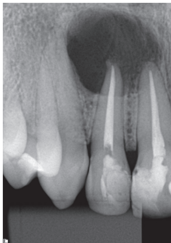
Figure 1A – Periapical radiographs. A) At baseline showing a radiolucent lesion associated with teeth 11 and 12;

Periapical radiographic examination indicated the presence of large, clearly defined, unilocular radiolucency surrounding the apex of endodontically treated teeth 11 and 12 (Figure 1A). Based on the information collected during anamnesis and on clinical and radiographic findings, a decision was made to perform the endodontic retreatment of these teeth. Clinical and radiographic diagnoses and treatment options were debated with the patient, who agreed on endodontic retreatment as the first choice. Informed consent was obtained from the patient.