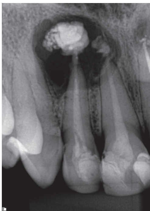
Figure 1B – After instrumentation's first session with addition of intracanal medication

The treatment was performed in multiple sessions, due the presence of exudation associated with the teeth. Thus, Ultracal®XS (Ultradent Products, Inc., US) calcium hydroxide paste was used as intracanal medicament, with two replacements (Figures 1B and 1C), aiming to control the persistent exudation verified between the return sessions.