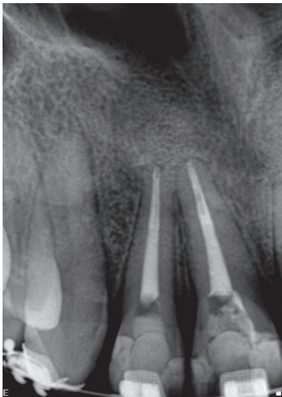
Figure 1E – After 24-month follow-up of endodontic treatment.