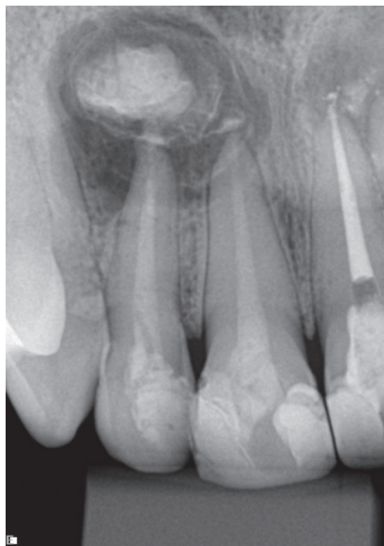
Figure 1C –After second session of replacement of intracanal medication