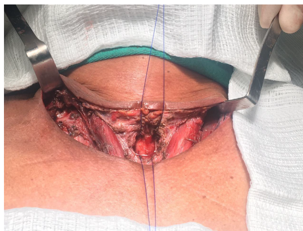
Figure 4. Aspect of the cervical cavity after performing a second cervicotomy to wash the anatomical site and drain the tonsillar collection.

Ludwig's Angina is a gangrenous cellulitis that affects the submandibular, sublingual and submental spaces, whose ability to spread through adjacent tissues is a remarkable feature 1 . Although odontogenic infections cause 90% of the cases, other known etiologies are penetrating lesions on the floor of the