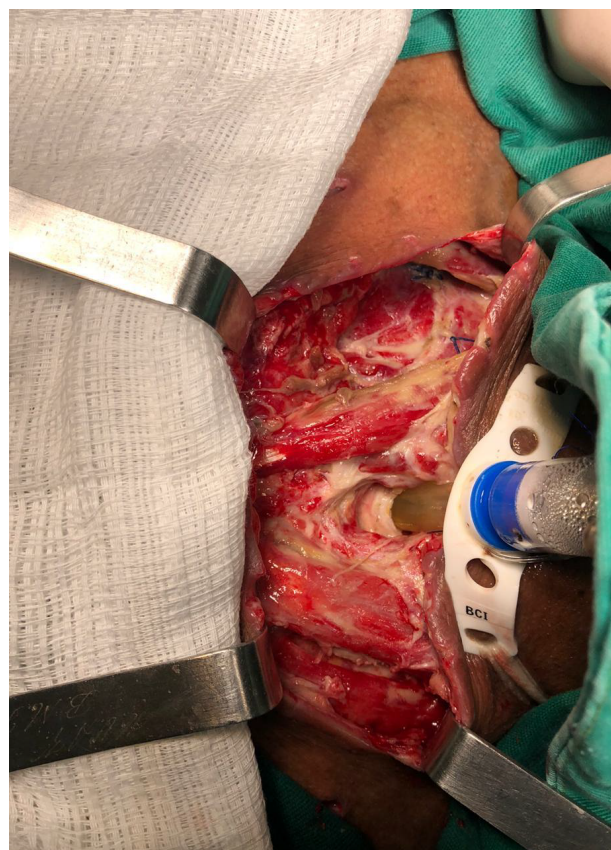
Figure 2. Cervicotomy by wide Kocher collar, showing anterior cervical tissue with necrosis and foul-smelling exudate affecting cervical muscle fasciae. Tracheostomy performed during the same surgical approach.