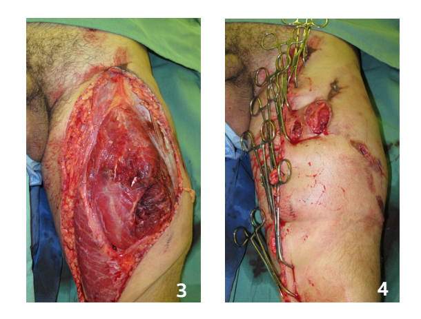
Figures 3 and 4. Case 3 – shows a degloved segment in the anterior/lateral posterior region of the left thigh (approximately 10% of the body surface). Note the preparation for withdrawal of in situ grafts and the temporary fixation with Backhaus tweezers.

In the ex situ option, the segment should be initially sectioned, and to reveal skin perfusion definition, a shaving test can be used, that is, initial incisions can be made to evaluate the presence of blood flow and bleeding. The removed segments are positioned (under tension, pulled using tweezers16 by an