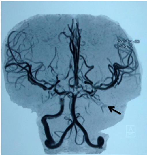
Figure 2 – Magnetic resonance angiography in the child #6 (Table 2), showing occlusion of the left internal carotid artery (arrow).

The STOP study screened 1930 children, identified 130 with abnormal TCD (MMV \geq 200 cm/s) and showed a 92% reduced occurrence of stroke in the group that received regular transfusions, compared to the group under observational conduct. Twelve stroke events were recorded over the 16-month study, 11 in the conservative treatment group and only one in the transfusion group. 10 However, transfusions were not free of complications and the time of primary prevention with chronic transfusions was questioned, which resulted in the STOP II study. After 30 months of transfusions, 41 patients had their transfusions discontinued, with 14 of them converting to high-risk by TCD and two of them had strokes, indicating the need to maintain regular transfusions. 16 In 2006, a new evaluation of the STOP study showed that six more strokes occurred in addition to the 12 stroke events over the study period, five of them in the transfusion group. The other occurred in a patient who left the transfusion regimen right after the end of the STOP study. After a 30-month follow-up, patients who had abnormal TCD flattened the survival curve,