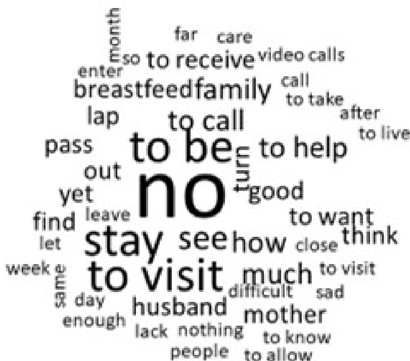
Figure 3 - Word Cloud. Fortaleza, Ceará, Brazil, 2021