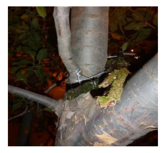
Figure 2. Preparation fixed to selected site tree (transplant).

One sample was stored as control (Moss control 1). The remaining trees were planted (transplanted) in existing trees in the premises to be subjected to the study, including the bark or trunks that received them and later secured with fine wire (Fig. 2). Five Asunción sites were selected, which include Av. Mcal. López and Avda. Madame Elisa Alicia Lynch (Moss 1); Avda. Aviadores del Chaco and Avda. Madame Elisa Alicia Lynch (Moss 2); Avda. General José Gervasio Artigas and Avda. Primer Presidente (Moss 3); Avda. Mcal. López and Avda. Perú (Moss 4); and Avda. Perú and Avda. Rodríguez de Francia (Moss 5) considering the vehicular traffic that was present in the area. The biomonitorers remained in those places during a period of 58 days (2 September 2013 -29 October 2013).