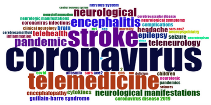
Figure 1. World Cloud with the most frequent keywords of the authors.

way, as observed in the terms teleneurology, telehealth and telemedicine highlighted. In addition, words such as mortality, pandemic, anosmia and neuroinflammation are also highlighted.