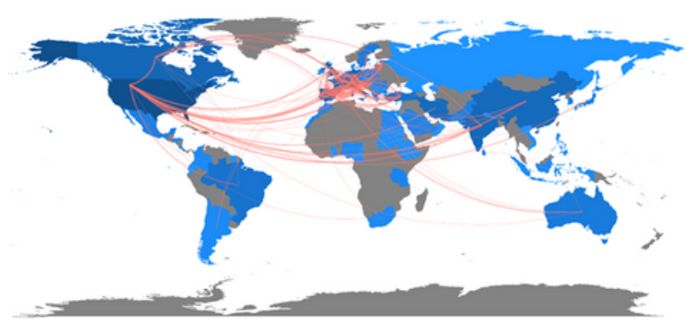
Figure 2. Country collaboration map for publications related to COVID-19 and neurological impact.

Figure 2 represents a map of collaboration between countries, in which the red lines symbolize this exchange. There is an intense collaboration between European countries, with emphasis on Italy and the United Kingdom (13 studies), Italy and France (12 studies), United Kingdom and France (12 studies). In addition, the United States of America makes contributions with countries from several continents, such as France (10 studies), Canada (9 studies), China (8 studies) and India (7 studies).