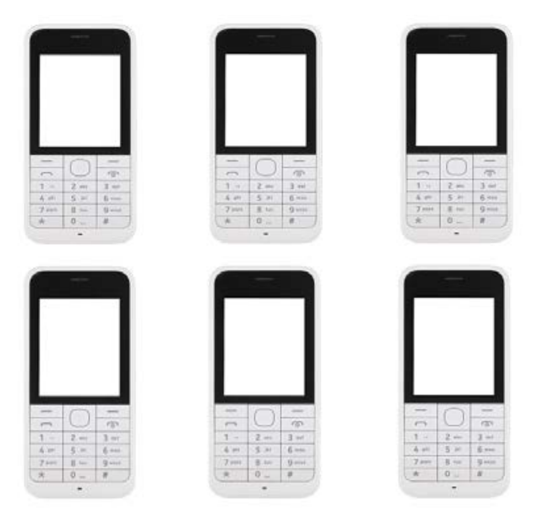
Figure 2: Illustrating the patient interface with the USSD interactions with questions adherence to medication and any current illness

Data Storage and Movement: All patient responses to the symptom questionnaire are stored within their ISS clinic facility. Aside from the symptom data, the only other patient information that is stored on the RapidPro server is the patient's phone number, their preferred language and a four-digit PIN that they use to access the system. The remainder of the patient-specific data is stored separately on the ISS clinic -hosted server, along with clinician login credentials and clinician-recorded notes. The dashboard would then use patient phone numbers, which is stored on both the ISS clinic and RapidPro servers, to query data from both databases and to present it to the clinician in an efficient manner.