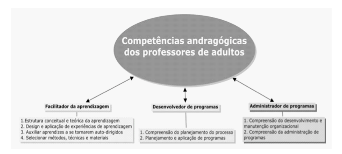
Figure 1 - Conceptual map about the abilities for adult's education according to Knowles. São Paulo, 2011

The structure of schools is also a concern, since the MEC data regarding the National Exam of Student Performance (Enade), has observed that there are problems in nursing education, since the overall average of Nursing (31, 9%) was lower than the overall average of Health (32.3%) in 2004<sup>(11)</sup>. The Enade<sup>(13)</sup> results in 2007 were similar to 2004: the overall result showed that the overall average performance was lower than desired, being a worrying situation and showing a necessity for reflection on the effectiveness of educational practices. The Enade grades aim