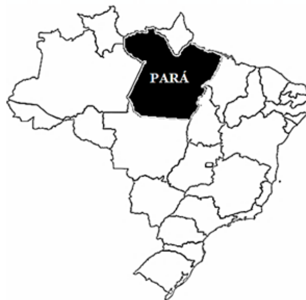
Figure 1: Map of Brazil with emphasis on the state of Pará

This study consisted of a quantitative, retrospective and cross-sectional approach. The research was carried out in Pará state, Brazil (Figure 1), a federative unit with 1,245,870.798 Km 2 , located in the Brazilian northern region [14]. Data were extracted from the Food and Nutrition Surveillance System (SISVAN), administered by the Ministry of Health, in line with the Secretariat of Primary Health Care, which allows public access to reports on nutritional status, food consumption and nutritional monitoring.