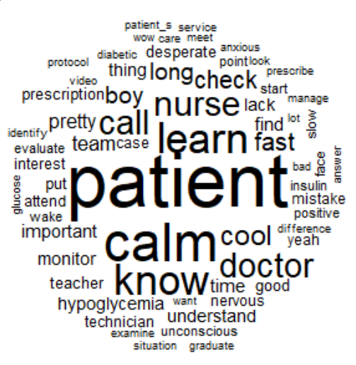
Figure 1 - Words cloud. Curitiba/PR, Brazil, 2023

The similarity analysis was also performed in Figure 2, which allowed a thorough investigation of the connections between the words based on their frequency. By highlighting the most frequent words and their connections, there is a junction of valuable insights into the language patterns and structure of the analyzed text.