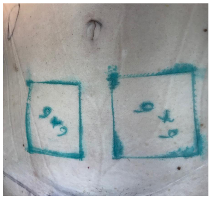
Figure 6. Prior marking of abdominal flap areas to be tested for burn after resection of classical dermolipectomy.

The laser was applied to the deep dermis of abdominal flaps of patients undergoing dermolipectomy to determine the temperature that causes skin burns, totaling 27 cases. According to a previously standardized back table technique, the temperature was measured immediately after resectioning the abdominal flaps, with marked areas of 6x6cm bilaterally (Figure 6).