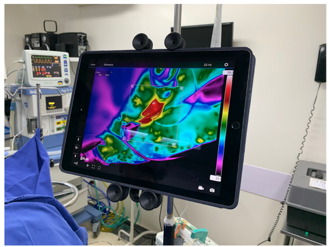
Figure 4. Tablet with Bluetooth transmission of the images of the thermocamera, in front position to the surgeon.

was used to cause skin retraction was made with the tip directed against the deep dermis at the linear 5 centimeters speed every 1 second.