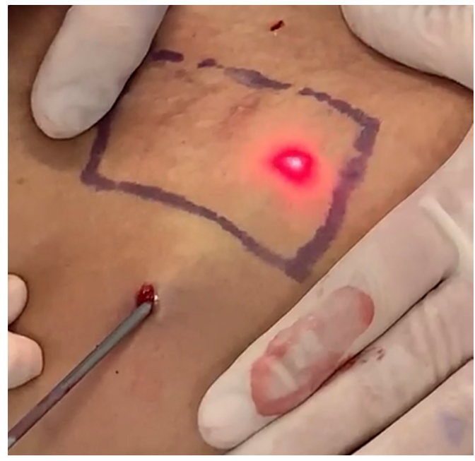
Figure 7. Determining the burn temperature with the laser in the flaps of dermolipectomy in back table.