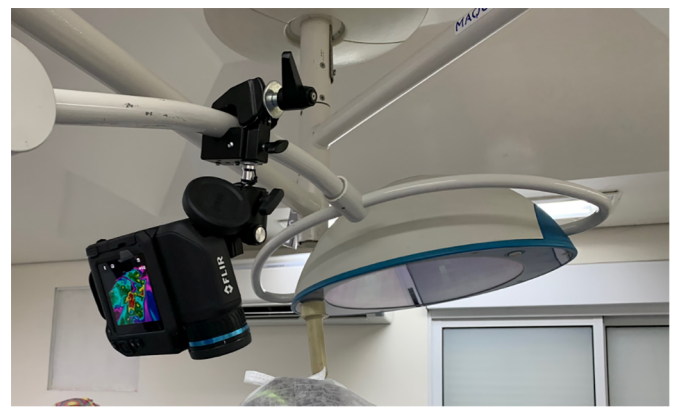
Figure 3. Fixation of the camera in the surgical focus.