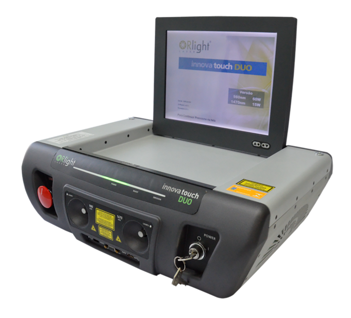
Figure 1. Orlight diode laser® Duo 980nm.

Eighty-three patients were submitted to laserlipolysis with the Orlight<sup>®</sup> Duo 980nm diode laser (Figure 1), between July 2017 and June 2019, at the Hospital da Plástica, São Paulo/SP. All patients in the study signed the consent form, and the study received approval from the ethics committee under number 0126/2019. The age range of the patients ranged from 17 to 75 years. All patients were female.