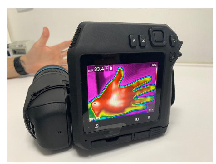
Figure 2. Thermocamera Flir \mbox{\ensuremath{\mathbb R}} model T540sc (Flir Systems Inc, Wilsonville, OR).