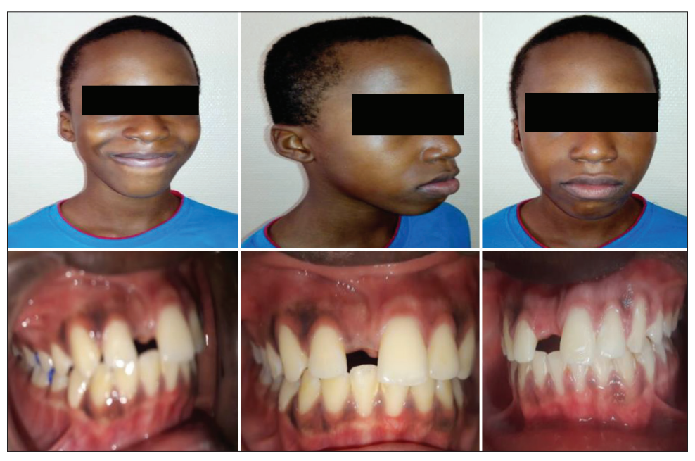
Figure 1: Before treatment.

Treatment commenced on April 11, 2018. The appliance was fixed, and an open coil spring was incorporated into the wire, after some months, to gradually create the needed space